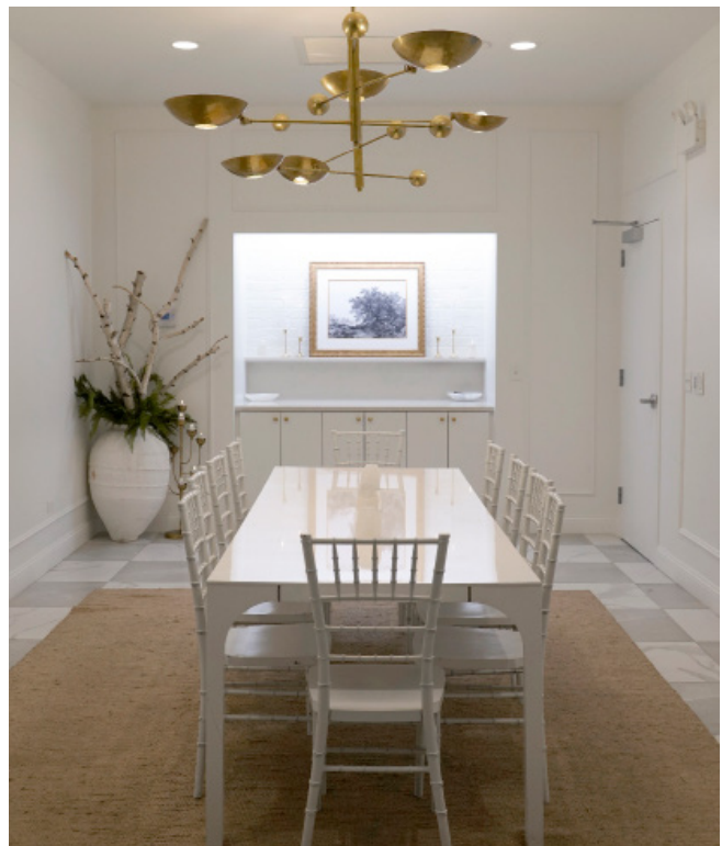
Selenite (set for 10)

With a nod to Eden’s original interior, you will be lifted into a room of lightness and clarity. Design details and finishes continue in from the main dining room, but curated elements from the brass light fixture, framed artwork, and fireplace mantle provide unique accents allowing the space to stand on its own. Adorning the room from its namesake are selenite crystals, that reflect the idea of the elements and simplicity that are influential in Eden’s menu creation.